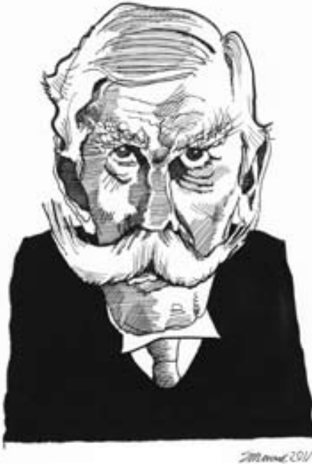
Justice Oliver Wendell Holmes, Jr.

Unselfish prosocial behavior toward strangers, including unselfish compliance with legal and ethical rules, is triggered by social context, including especially: instructions from authority; beliefs about others' prosocial behavior; and the magnitude of the benefit to the others. Prosocial behavior declines, however, as the personal cost of acting prosocially increases.